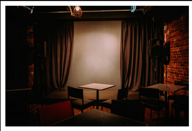
INSIDE / BOX OFFICE

This image is of the Cabaret stage, which will soon be turned into the Cellar theatre by the time Fringe 2024 has arrived. The seating layout will likely be different on the day of performance, but the stage will remain very similar.