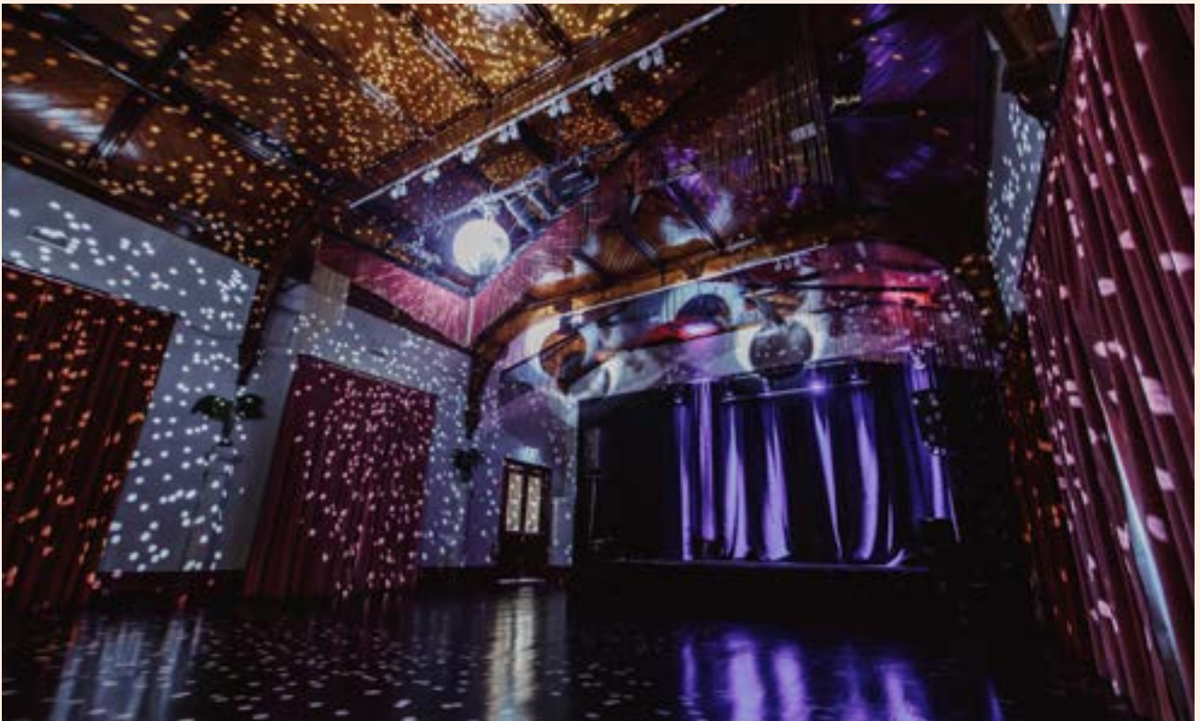
FRINGE COMMON ROOMS 2021.