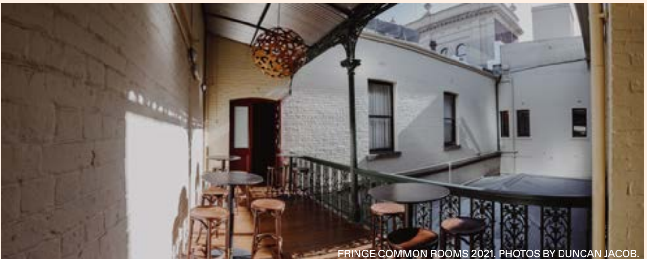
FRINGE COMMON ROOMS 2021.