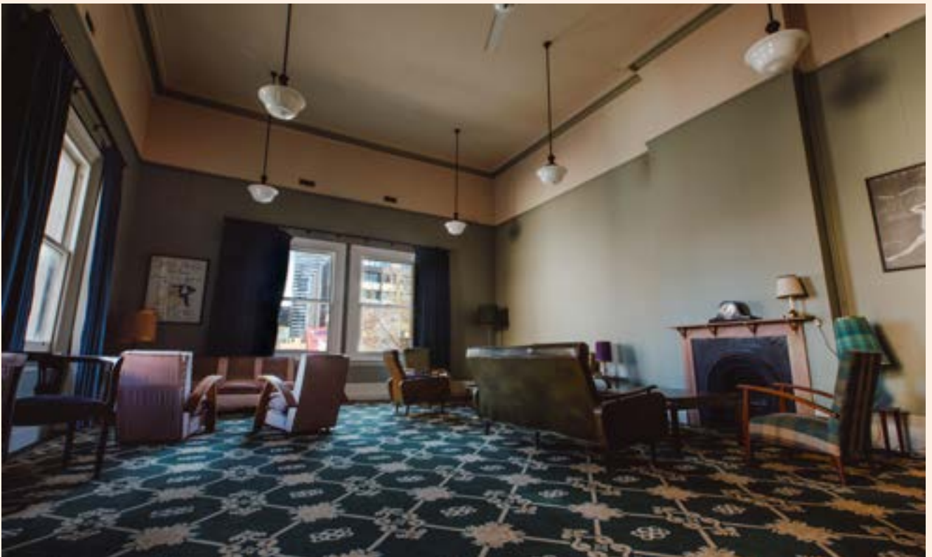
FRINGE COMMON ROOMS 2021.