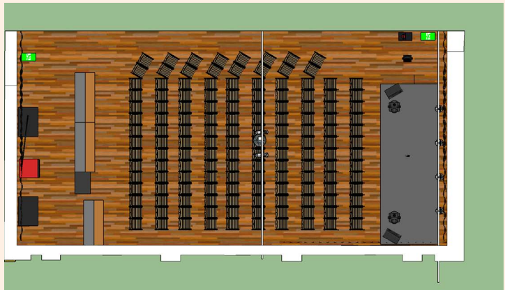
COMMON ROOMS - 146 SEATS